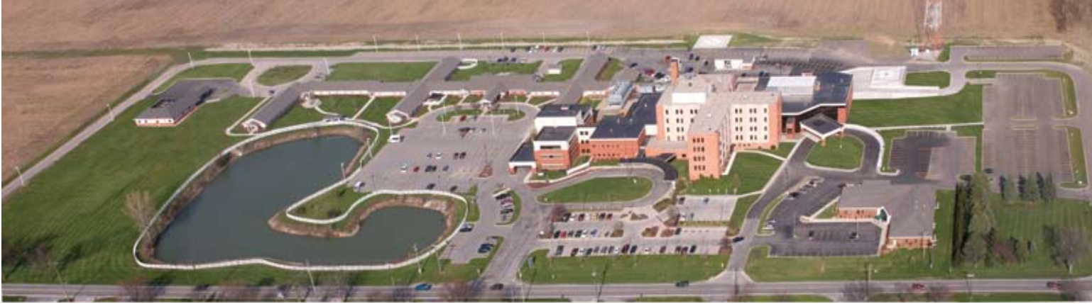
Fulton County Health Center - 2009