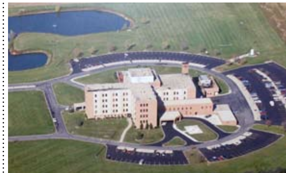
Fulton County Health Center - 1991