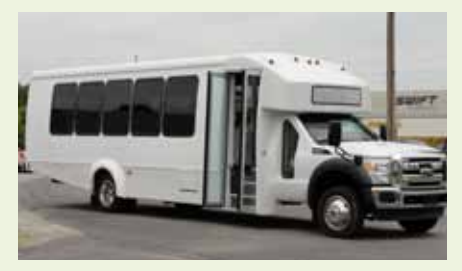
Proceeds from the FCHC Auxiliary Golf Outing are being used to purchase a new van for Fulton Manor.

We would like to thank the sponsors of our Sept. 14th Health and Wellness 5K Run/Walk and 1K Run/ Walk. Our Sponsors include Olympian Level: Absolute Pharmacy, APRN, Archbold Container Corporation, Culligan Water Conditioning, Emilie's Photo Designs, FCHC Medical Staff, Hagerman Family Physicians, TJ Automation. Marathoner Level: Farmers & Merchant State Bank, Haas Farms, Holiday Inn Express, Sauder Woodworking, State Line Farms, Wauseon Machine & Manufacturing, Inc. Sprinter Level: Countryside Farms Drainage, First Federal Bank, Kuntz Quality Builders, Worthington Industries. Other Sponsors (Door prizes & refreshments): A.K.A Designs, Circle K, Barron's Café, Big Buffalo Pawn Shop, Farmland News, Sauder Village, Taco Bell.