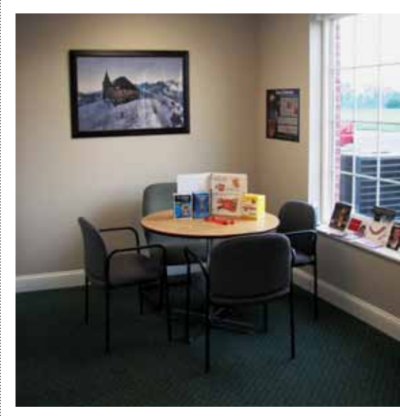
FCHC's Diabetes Education Department has expanded its outpatient program to a separate office within the new FCHC Swanton Sleep Lab location.

FCHC Diabetes Education has renewed its prestigious Education Recognition Certificate from the American Diabetes Association. The certification recognizes FCHC as having a quality diabetes self-management education program, which is an essential component of effective diabetes treatment. The program has been continuously recognized since July of 2000. The ADA's Education Recognition Certificate assures that FCHC's educational programs meet the National Standards for Diabetes Self-Management Education Programs.