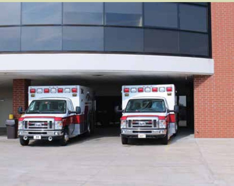
When a higher level of care is needed, a patient can be transported using ground or air emergency transport.

Zoll® is a registered trademark of Zoll Medical Corporation.