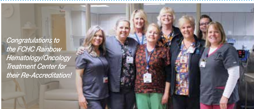
Congratulations to the FCHC Rainbow Hematology/Oncology Treatment Center for their Re-Accreditation!

April is Donate Life month and we're making noise for organ, eye, and tissue donation! Join us at POUND® for a Purpose to raise money in support of organ, eye, and tissue donation. Come for 30 minutes or stay for 3 hours. Proceeds to benefit Life Connection of Ohio. Sat., April 4, 1:00 - 4:00 p.m. FCHC Wellness Center, 138 E. Elm St, Wauseon. Suggested donation: $20. Call to reserve a spot! 419-330-2735.