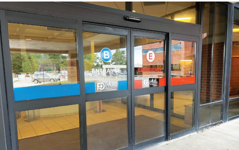
(Pictured Above): The Ambulatory Emergency Department entrance doors have color signage to show both the corresponding access to our main facility and the Emergency Department.

consider what they need to know to get around, and to make it simple enough for them to follow and to make relatively quick decisions while driving. When the project has been finished, we are confident it will be much easier for people to find their way around our campus.”