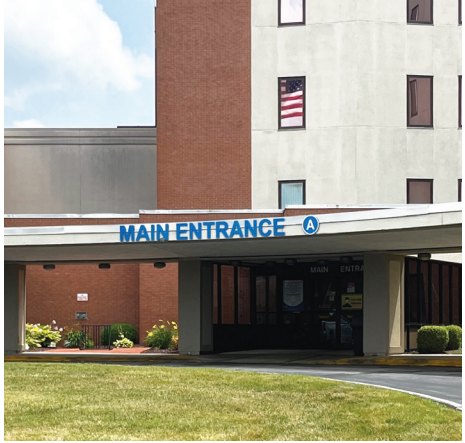
The main entrance to FCHC is clearly marked on the building.

“The project will require three separate stages, and we are in the first Stage right now,” says Simpkins. Stage 1 includes adding signage to the road entrances of the campus for drive access points which lead to individually marked parking lots. It includes upgrading the illuminated LED signs on the Emergency Department’s canopy for higher visibility. Large “Main Entrance” letters were installed on the main canopy of the Health Center. In addition, a pedestrian sign was installed at the main entrance to help navigate sidewalk traffic. Several out buildings and parking lot signs have also been upgraded. “Stage 1