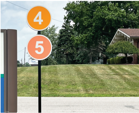
All road entrances to the FCHC campus are being marked by large colored signs.

A campus map is being developed that will be available in print form and online.