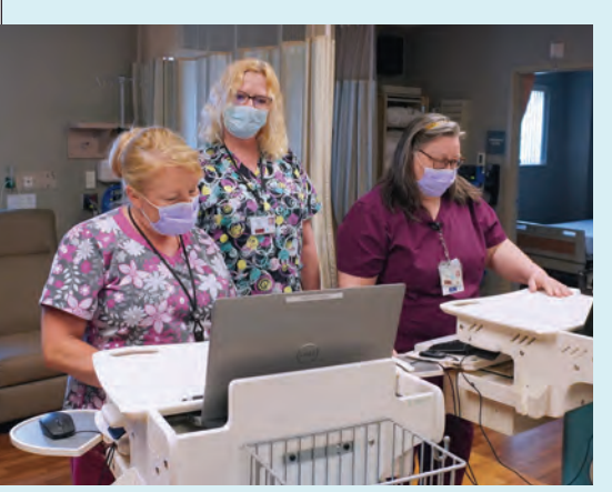
Members of the FCHC Cancer Care department keep detailed medical records for each patient they treat.